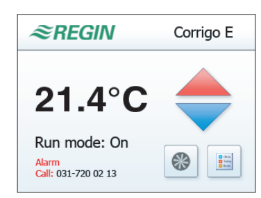
The start page